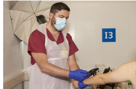
Figure 1. The dermoscopic image capture process

They will then take a deeper and more detailed image with a special lens called a dermatoscope. Figure 1 shows an example how the dermoscopic image capture process is performed. This is generally painless but it might be a little sore on tender lesions/moles. Only this dermoscopic image will be analysed by DERM, which will provide a suspected diagnosis, using highly developed software to decide what the most appropriate next steps should be for your care.